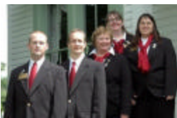
Our GSE Team To England, Fall 2009